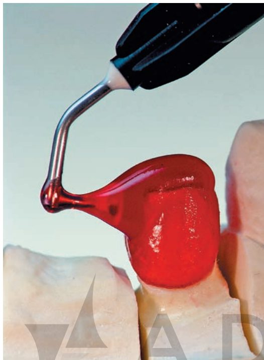
Applying primopattern LC gel