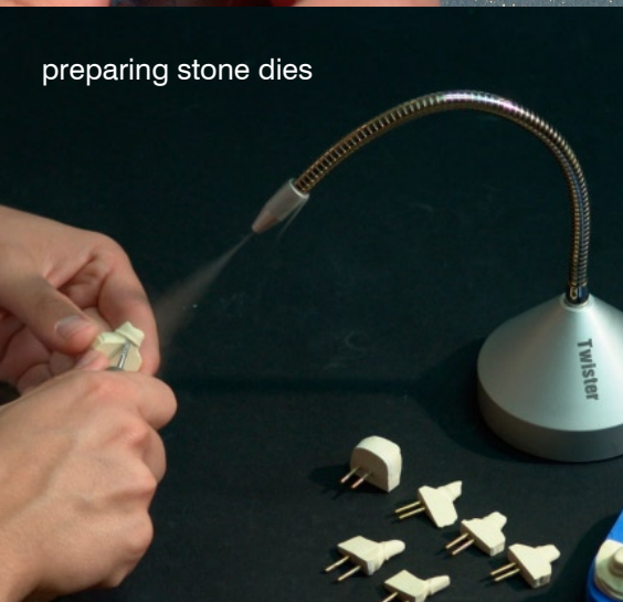
preparing stone dies