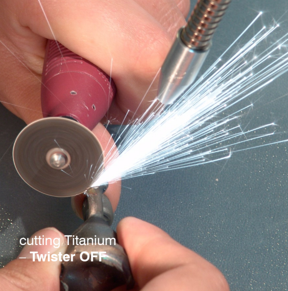
cutting Titanium – Twister OFF