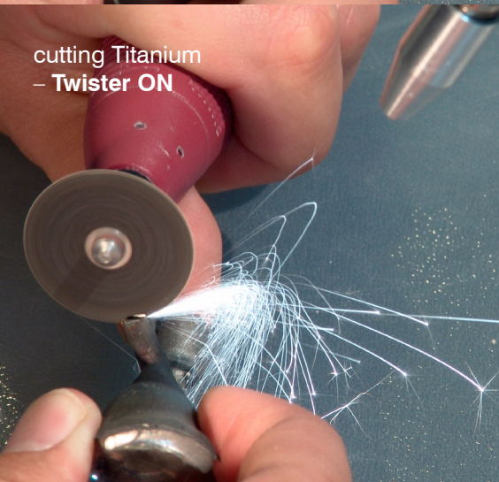
cutting Titanium – Twister ON