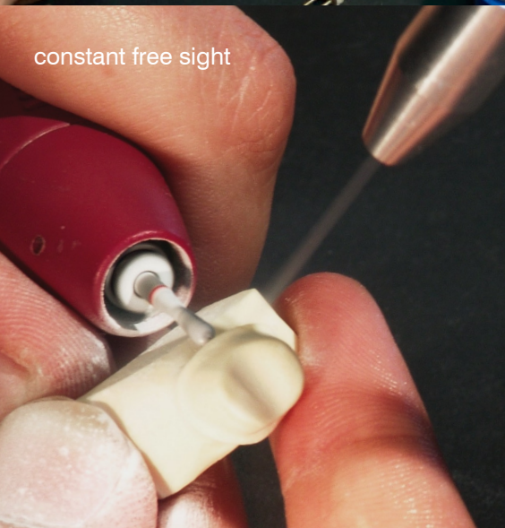
constant free sight