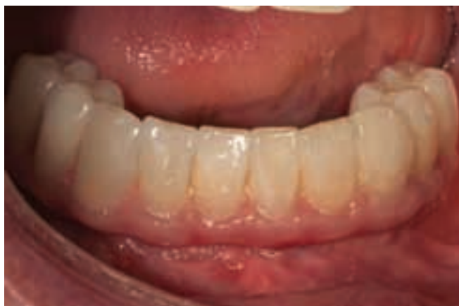
Fig. 19: Front view (final)

The various prosthetic protocols were carried out for try-ins and establishing a proper plane of occlusion and the fixed bridge was screw retained. Excellent exit of the screw holes in the prosthesis was achieved, through planning, clinician-lab communication and also with stereo lithography stents that would allow the trajectory to be at the center of the cingulum of the implants. The case was extremely successful and the patient was pleased. Oral hygiene instructions were given to the patient. It is noted that on one of the photographs, he has a maxillary temporary denture only on several teeth. Phase II of this treatment will be to remove the remaining maxillary teeth and establish the same protocol of implant placement on the maxillary arch. The patient is in treatment for the maxillary arch and the part two would be to show the completed case with the maxillary reconstruction. ■