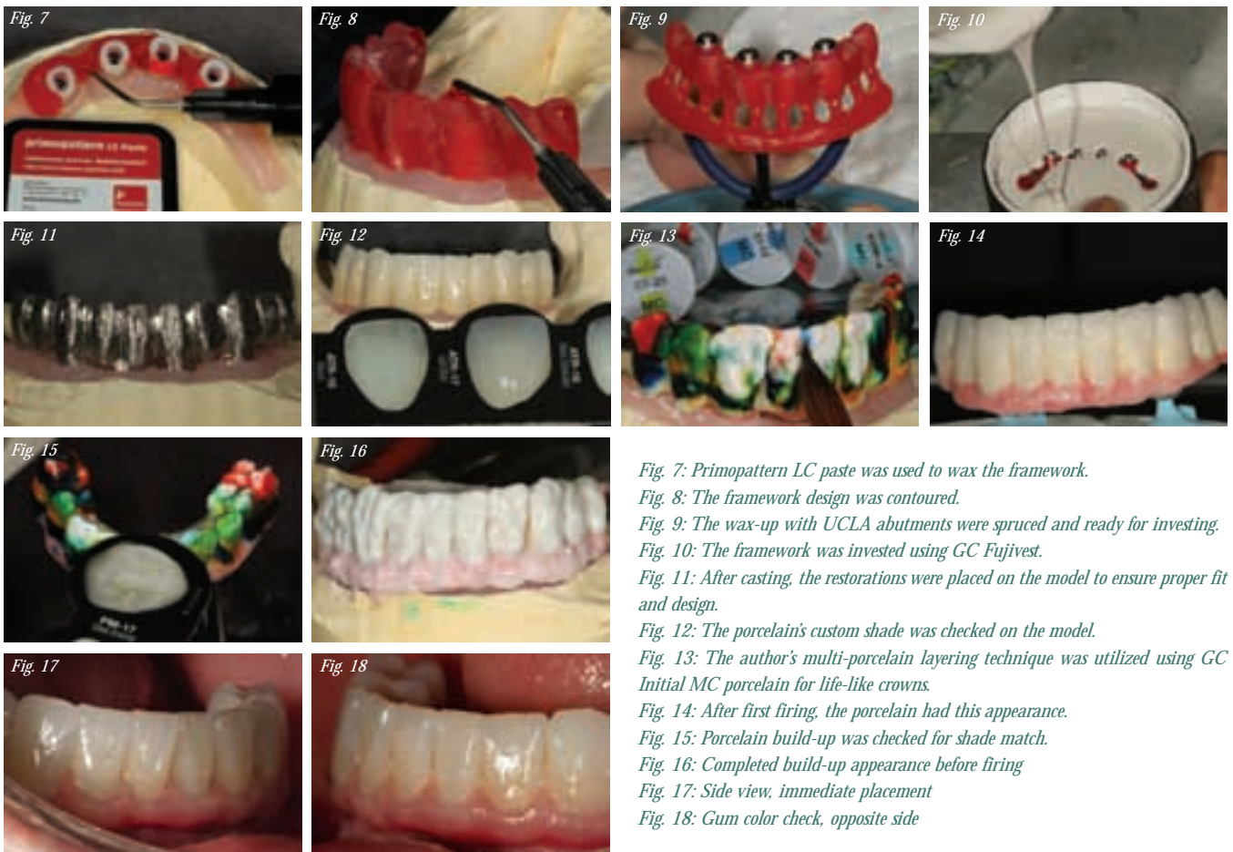
Fig. 7: Primopattern LC paste was used to wax the framework.

These modifications were applied based on the author's impression of the patient's existing dentition and his applied